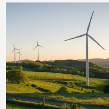
'Best in Class' for Sustainability